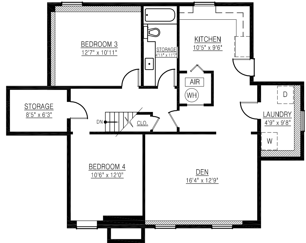
LOWER FLOOR PLAN FLOOR AREA: 1116 sq.ft.